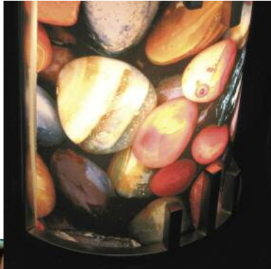
AGATE WALL SCONCE